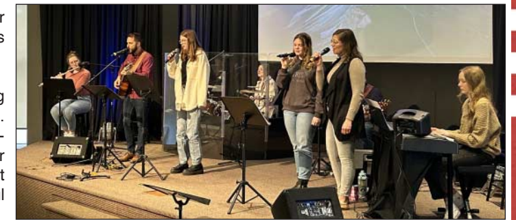
Youth worship team