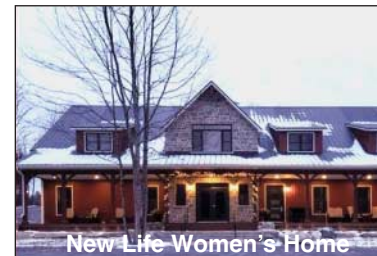
New Life Women's Home