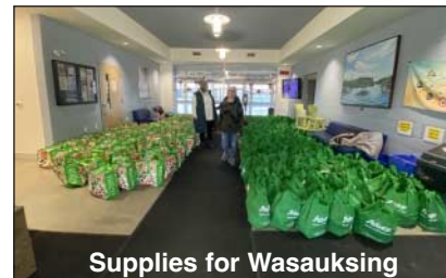
Supplies for Wasauksing