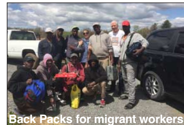
Back Packs for migrant workers