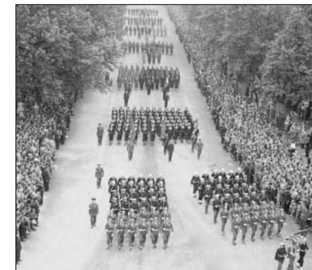
1946 Victory parade in England after WWII

What a blessing it is here at Emmanuel to have so many people with their faces to the coal, serving in so many ways to help others in times of need, praying for God to intervene, teaching children week after week the good news about Jesus,